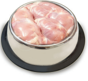
Chicken thighs boneless