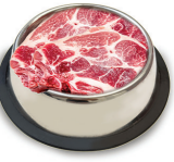
Pork muscle boneless