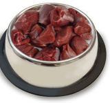
Roe deer, fallow deer, deer