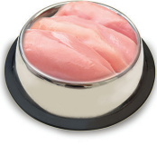
Chicken breast boneless