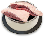
Duck breast boneless