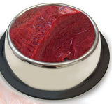
Beef muscle tenderloin boneless