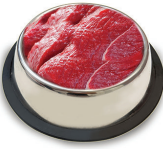
Beef selection boneless