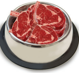
Beef sirloin with bone