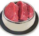
Beef slices EXTRA