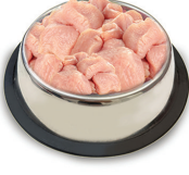
Turkey meat with gristle